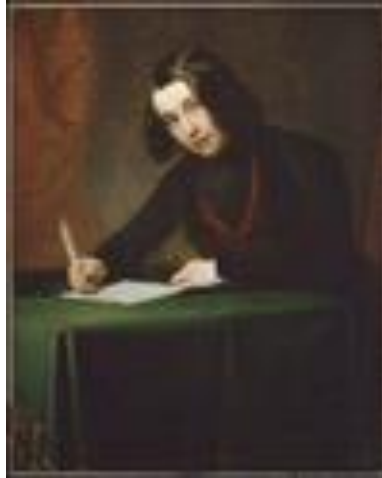
Charles Dickens (1842) Francis Alexander (1800-1880) Wikipedia