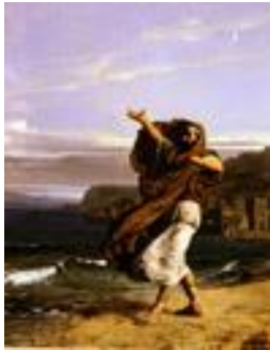
Demosthenes Practising Oratory (1870) Jean-Jules-Antoine Lecomte du Nouÿ(1842–1923)

REM: Your Term Paper is due next week . . .